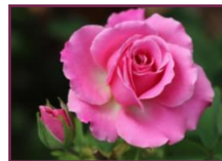
Signature Rose Best Friend