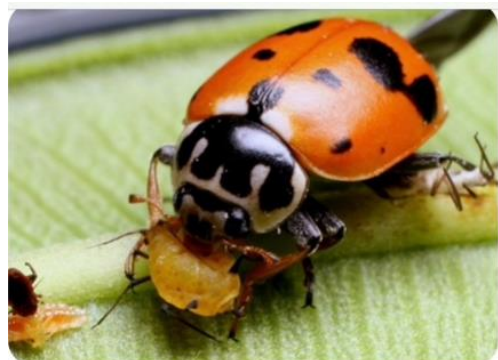
Hippodamia variegata adult eating an aphid