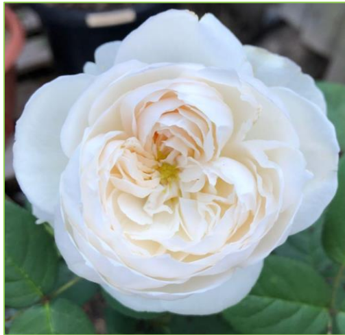
Top left: 'Happy Anniversary'

Hybrid Tea, orange blend, 26-40 petals, exhibition form, borne mostly on single stems, moderate fragrance, 1997.