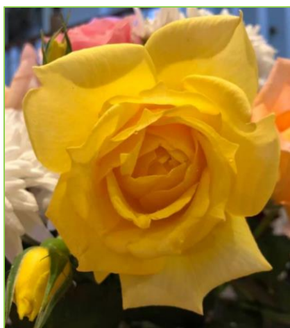
Left : 'Gold Bunny' MEIGRONURI

We have been self isolating pretty much most of the time - just Bunnings and Woollies shops etc. I did drop in to Mark's nursery yesterday and had a cup of tea with him but was very careful of course... I've been potting up some little goodies for our UNSH stall ...I'm also collecting seeds which I will put into envelopes for sale too - right now my Cleome's are seeding like crazy so every day I go out and pick off more seed pods (the ones that don't pop before I can pick them off). I've also got a lot of seeds from my Zinnia's - those were the packet that we each got at the NHBM Rose Show when we were there last year. I've even had some of them come up and flowering since then too. Plus there are a few other plants that seed which I will also collect - just something a bit different from all little plants...Anyways, stay safe and looking forward to the time when we can all be back together again.'