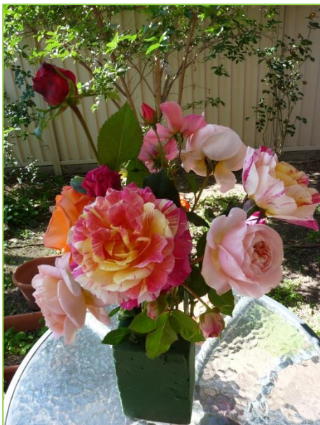
Left: 'Maurice Utrillo' (striped, centre) with 'Abraham Darby' (light pink, right) with assorted cultivar buds

This situation made me think that the roses which were giving me so much pleasure in my own garden, might give some pleasure to others through simple reflection. And so every week, I began posting photos of my autumn rose bouquets on the Group's Facebook page, which are now viewed by dozens of locals whom I have never met. I even get the occasional rose culture query as a result. I conclude by showing you some of these performers from my garden that are helping to inspire a community." (See page 10 for details on roses illustrated and mentioned)