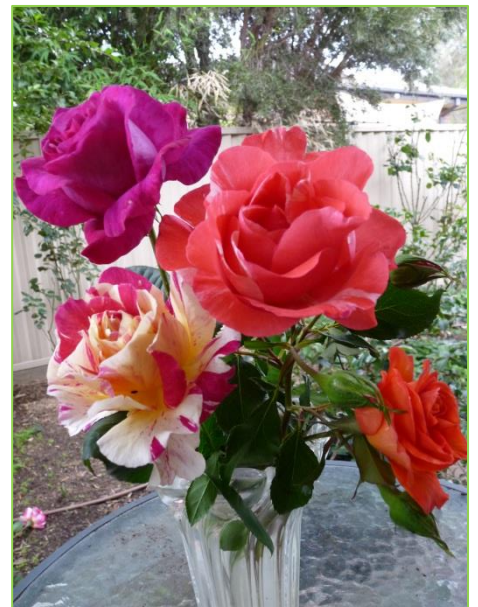
Right: 'Chartreuse De Parme' (purple), 'Maurice Utrillo' (striped), 'Grimaldi' (orange, striped), and 'Apricot Gem' (deep orange)