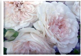
UNSH SIGNATURE ROSES: KARDINAL & SOMBREUIL

The Rose Society of NSW Upper North Shore & Hills Regional