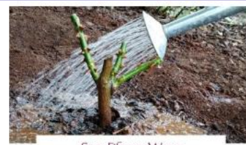
Step Fifteen: Water Give the rose another good drink. Water is the key to a bare root roses success.