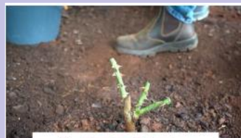
Step Fourteen: Trim stems Trim each stem down to approx. 20cm above the graft. Trim 1cm above a growth eye.