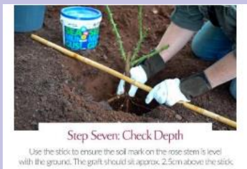
Step Seven: Check Depth Use the stick to ensure the soil mark on the rose stem is level with the ground. The graft should sit approx. 2.5cm above the stick.