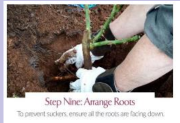
Step Nine: Arrange Roots To prevent suckers, ensure all the roots are facing down.