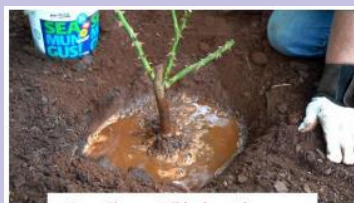
Step Eleven: Fill hole with water Fill the hole with water and allow it to sit until the bubbles stop coming to the surface.