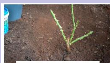
Step Twelve: Backfill the hole Finish filling the hole with the remainder of the soil. Gently firm down the soil.