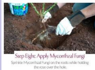
Step Eight: Apply Mycorrhizal Fungi Sprinkle Mycorrhizal Fungi on the roots while holding the rose over the hole.