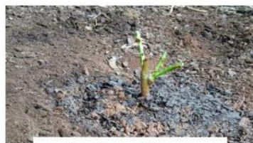
Step Sixteen: Aftercare For the first year water 2 - 3 times a week with 10 litres each session. Do not fertilise until the rose flowers.