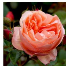
Heaven on Earth