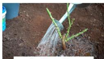
Step Thirteen: Water Give the rose another good water in.