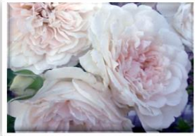
UNSH SIGNATURE ROSES: KARDINAL & SOMBREUIL

The Rose Society of NSW Upper North Shore & Hills Regional