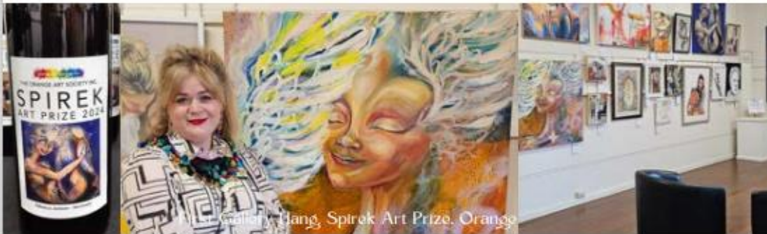
Gallery Hung, Spirek Art Prize, Orange