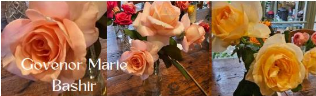
Govenor Marie Bashir