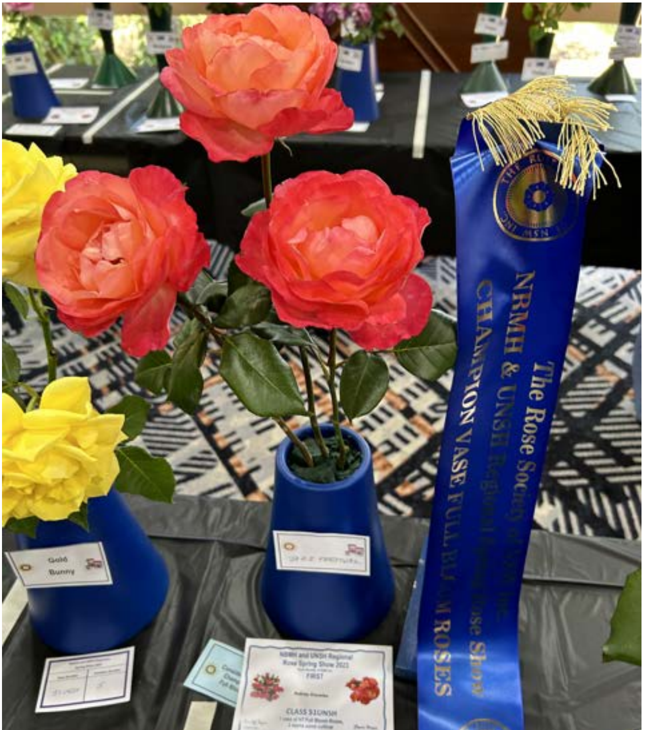
Aubrey's Champion Vase Full Bloom Roses - Jazz Festival.