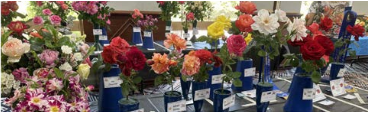
Our Spectacular UNSH Bench laden with showstoppers!