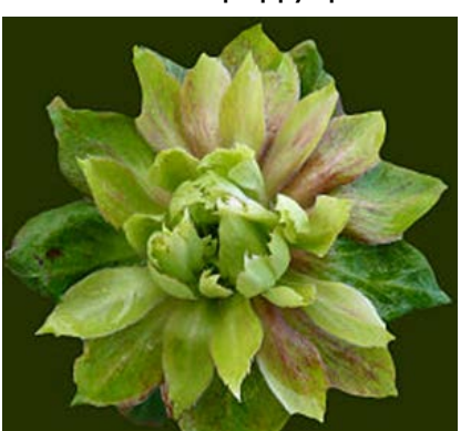
The 'Green Rose' has a stable mutation causing phyllody in all of its flowers