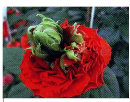
Vegetative centres are sometimes referred to as a "bloom in a bloom", courtesy of Gaye Hammond.

Just like in humans hormonal imbalances can be caused by a lot of things.