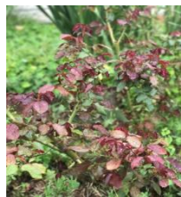
Warwick's successes (above)