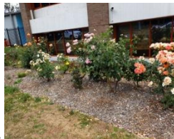
... A moved rose →