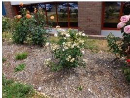
← Still at Council →

The second lot of roses were not so lucky. They were loaded onto the back of my ute, with not quite so much care and attention but with as much speed and care as one oldish woman could manage (the garden labourer aka husband Maurie was on light duties due to surgery) with a small bit of help from the contractor. As I was done in by then the rescued roses spent that night on the back of the ute. Next day they went into holes the best that could be dug by the same oldish woman and light duties labourer. But after that they received much loving care, many hundreds, perhaps thousands of litres of water and some much needed trimming. Later they got liquid Seamungus when I thought they would be up to it.