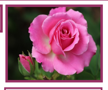
Signature Rose Best Friend

Soon we will be active pruning, spraying and mulching our roses.