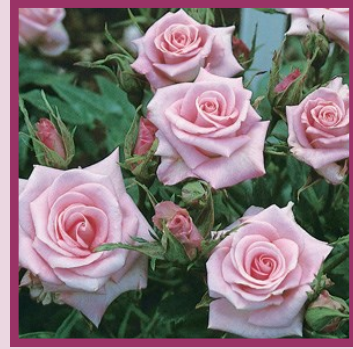
Miniature rose 'Baby Boomer'