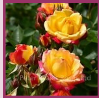
Miniflora rose 'Little Sunset'