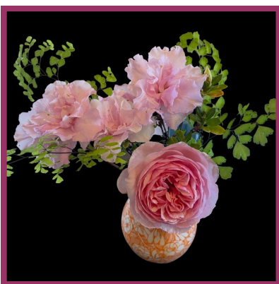
David Austin rose with Azaleas