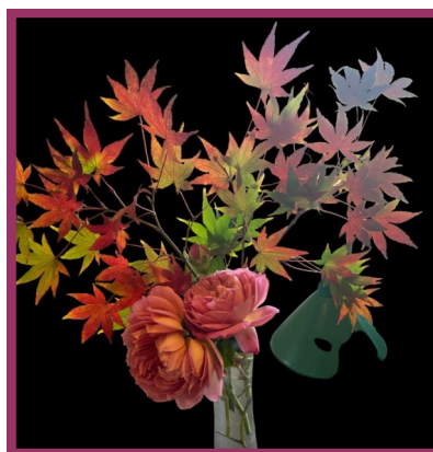
Roses with Autumn Leaves