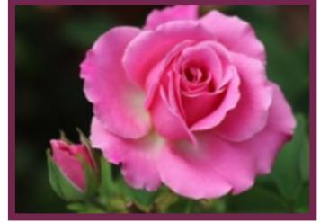
Signature Rose Best Friend