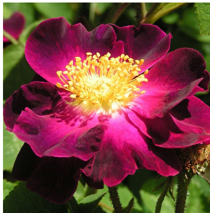
La Belle Sultane-Gallicao