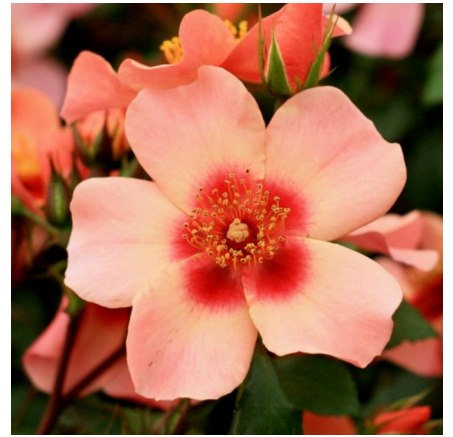
For Your Eyes Only