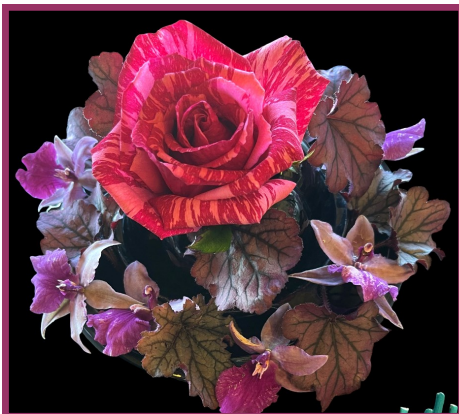
Pink Intuition with Oncidium