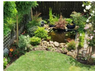
Jo's frog pond (just to fill a space)