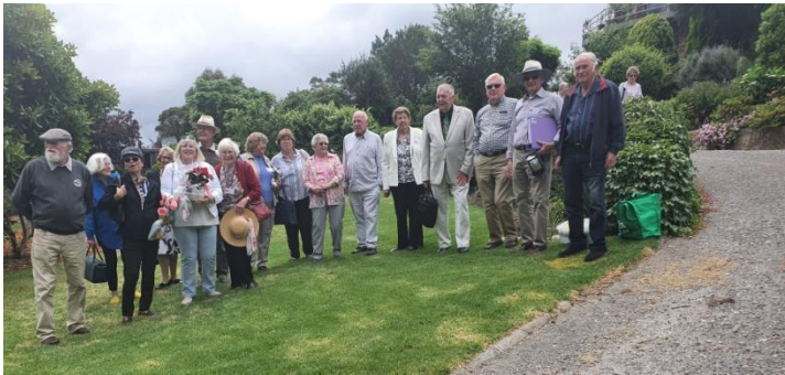
Just time for a quick group photo