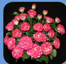
'Imp' Foundation Rose of the Regional