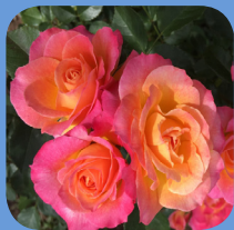
'Joyce Abounding' Signature Rose of the Regional