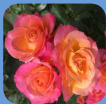
'Joyce Abounding' Signature Rose of the Regional