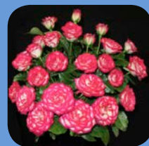
'Imp' Foundation Rose of the Regional

October/November 2020- Volume 12 No. 10/11