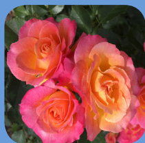
'Joyce Abounding' Signature Rose of the Regional