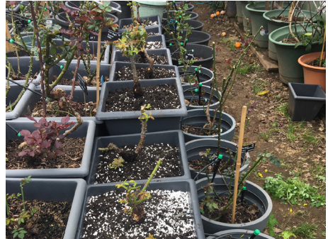
Special delivery planted.