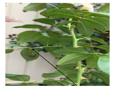
Snail climbing the rose bush

vegetables in the garden. A bad infestation can completely weaken and damage plants such as clyvias. The good news for organic gardeners—other than squishing or drowning— is that there are some easier solutions. Nature's Way 'Dipel' insecticide or Eco-Neem oil are both effective at controlling caterpillars. Stephanie Judges