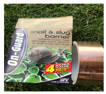
Organic snail and slug barriers are available from your local nursery or Bunnings store.

thought snails would be much of a problem to roses. In fact their feces are high in nitrogen, which benefits roses, but I have discovered that they are great climbers who seem to be able to dodge thorns, and have great clinging abilities. Their persistent munching causes hold and leaves left with only a vein or two left behind. For a small infestation you can just squish them, but I found a great organic solution is a slug and snail copper barrier taped carefully in a circular shape around the base of my rose bush will keep them away.