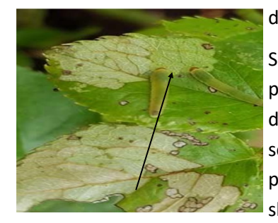
damage is the skeletonization, and the defoliation of the rose leaf (see bottom right).

Sawflies and caterpillars may be difficult to tell apart. Caterpillars have fish hook like structures called prolegs, which sawflies don't have. A tell tale sign of sawfly