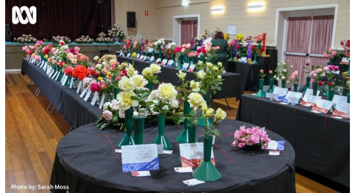
Display of exhibits and from suburban gardens

-The show was a credit to everyone. I can only show some photos of special moments