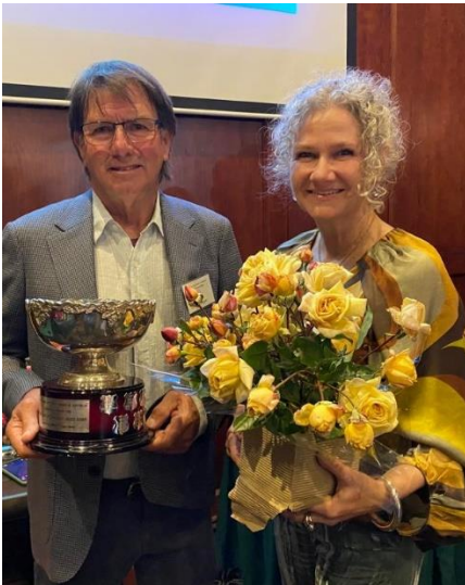
Australian Bred Rose Award 2023