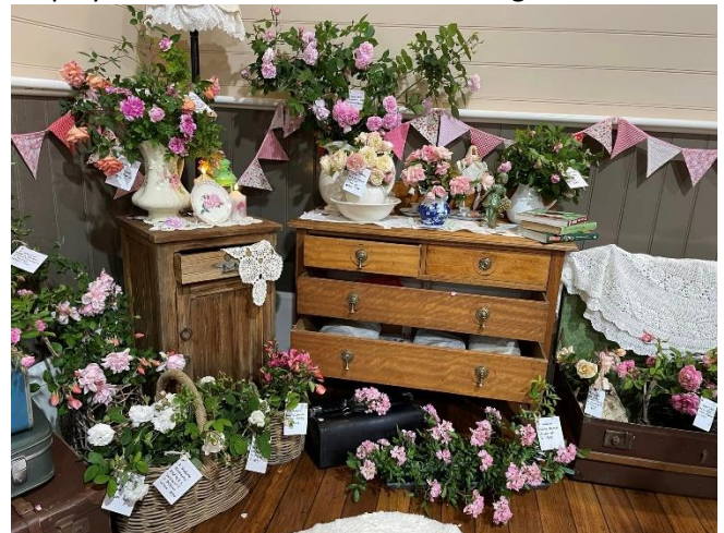
Intan's Heritage Rose Display