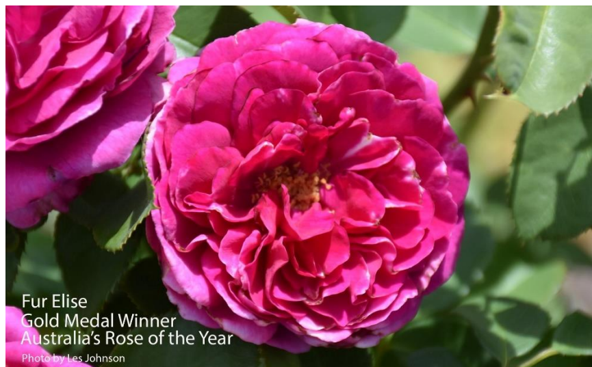
Gold Medal Winner – 2023 Australian Rose Trial Gardens