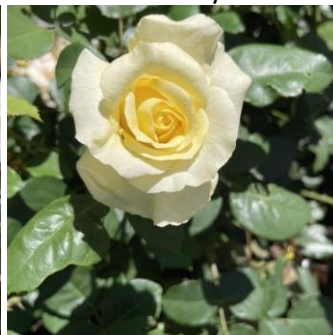
Lady of Australia