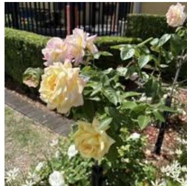
A visit in late february for fertilising and deadheading. Thankfully we have found two more volunteers to take on some of the maintenance of the garden. The rose on the left is the peace rose.