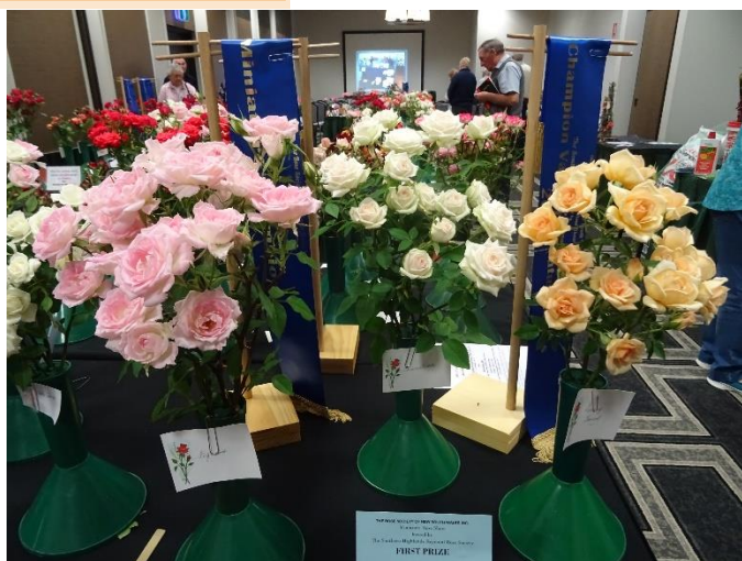
PHOTO: Miniature Rose Show 2017