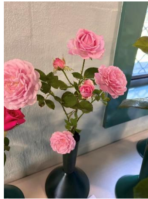
Photos: 1. Miniature roses; 2. Any cut from my Garden; 3. Display table; 4. Chris's photo; 5. Back pink rose- Gary Bickford's polyantha Cecile Brunner; 6. Kristin's My Hero