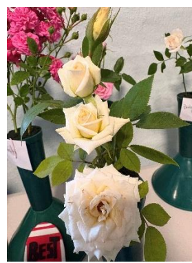
Kristin’s Bud to full bloom Irresistible