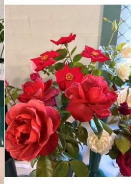
Mod Decorative roses