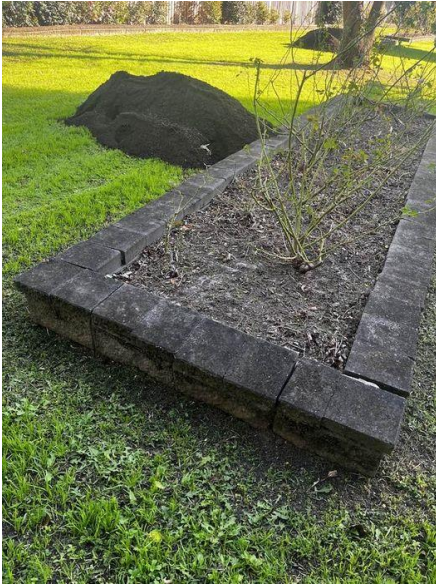
SOIL ARRIVES FOR THE BEDS TO MOVE