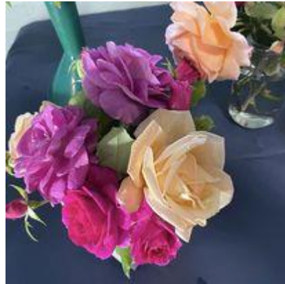
Roses on display