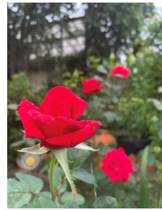
Kardinal – HT