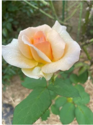
Apricot Nectar -FI