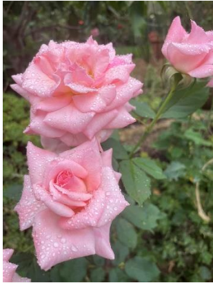
Bridal Pink -FI