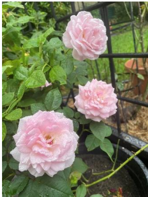
My Hero -Ht