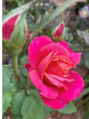
The Governor's Wife-Shrub