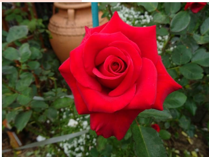
Happy Valentine's Day