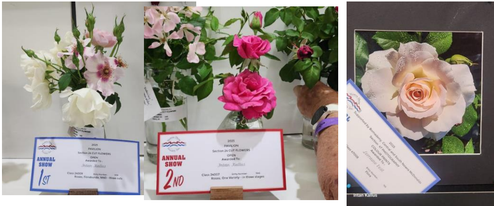
First two photos are Intan's roses and the third is of Lorraine's winning photograph.

Nowra Show 7-8th February and Intan once again shone through with not only roses but also with wonderful creative arts. Lorraine Vost won photography with a spectacular photo of Seduction