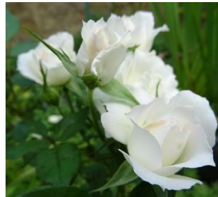
(Left) Baby Jack – Baby Boomer - right)

Miniature roses are the smallest of roses usually less than 5 cm across, but often perfectly formed and with stems or clusters that mimic the hybrid tea or floribunda rose. Miniflora roses are larger than miniature roses, but smaller than floribunda roses. Many of the miniatures and miniflora grown in Australia are Australian bred as quarantine restrictions have limited the importation of such roses over the years. Bernadella miniature roses bred in the USA are popular here, but there are many Australian bred miniatures and Miniflora roses with some now commercially available.