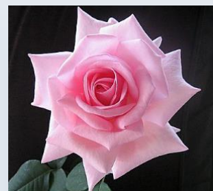
Governor Macquarie Rose –Signature Rose of the Hunter Valley Regional Rose Society