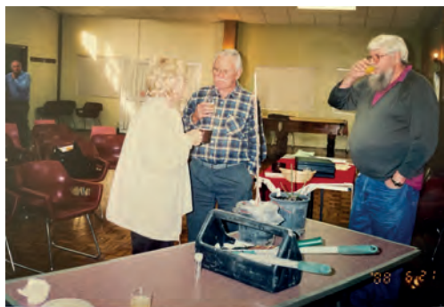
Rose Society Wake at Coniston Hall

1980 showed more growth in the Regional and a donation of $106.50 made to the Deaf Society for the FINAL payment to be made on the land at Coniston.