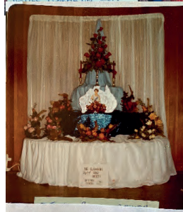
ate Championships Beaton Park 198