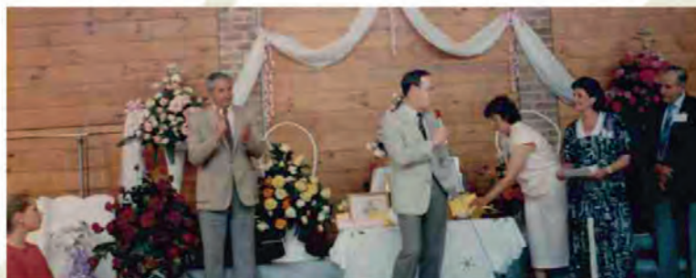
Spring Show at Figtree High School