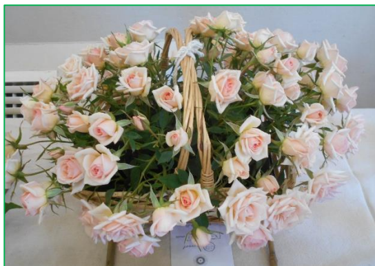
Class 51 A basket of miniature roses