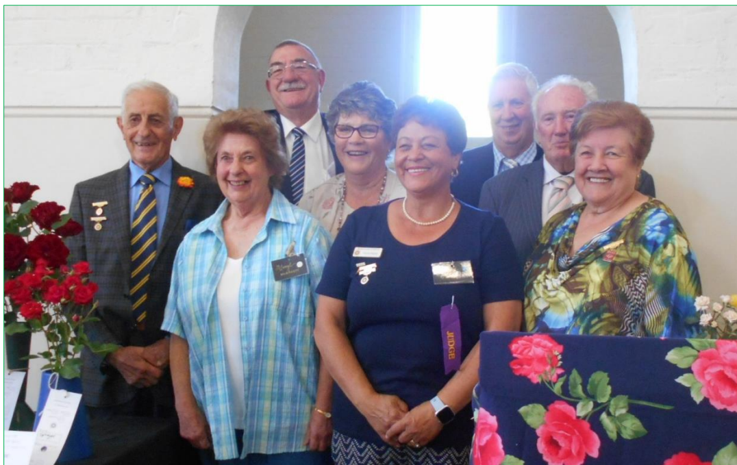
Judges at the UNSH Spring Rose Show.