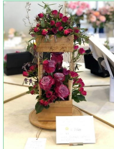
Above right: "A Box of Roses" 1 st