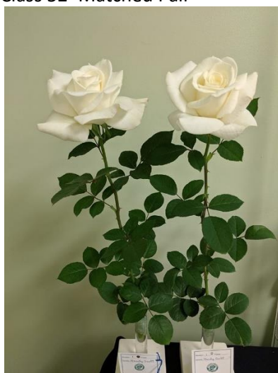
Class 52 'Matched Pair'