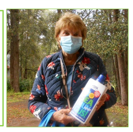
Page 4 UNSH Newsletter 2020. 9 September-October

UNSH members who won lucky door prizes when they came to support our Plant Stalls.