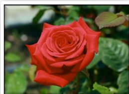
UNSH Signature Rose Kardinal