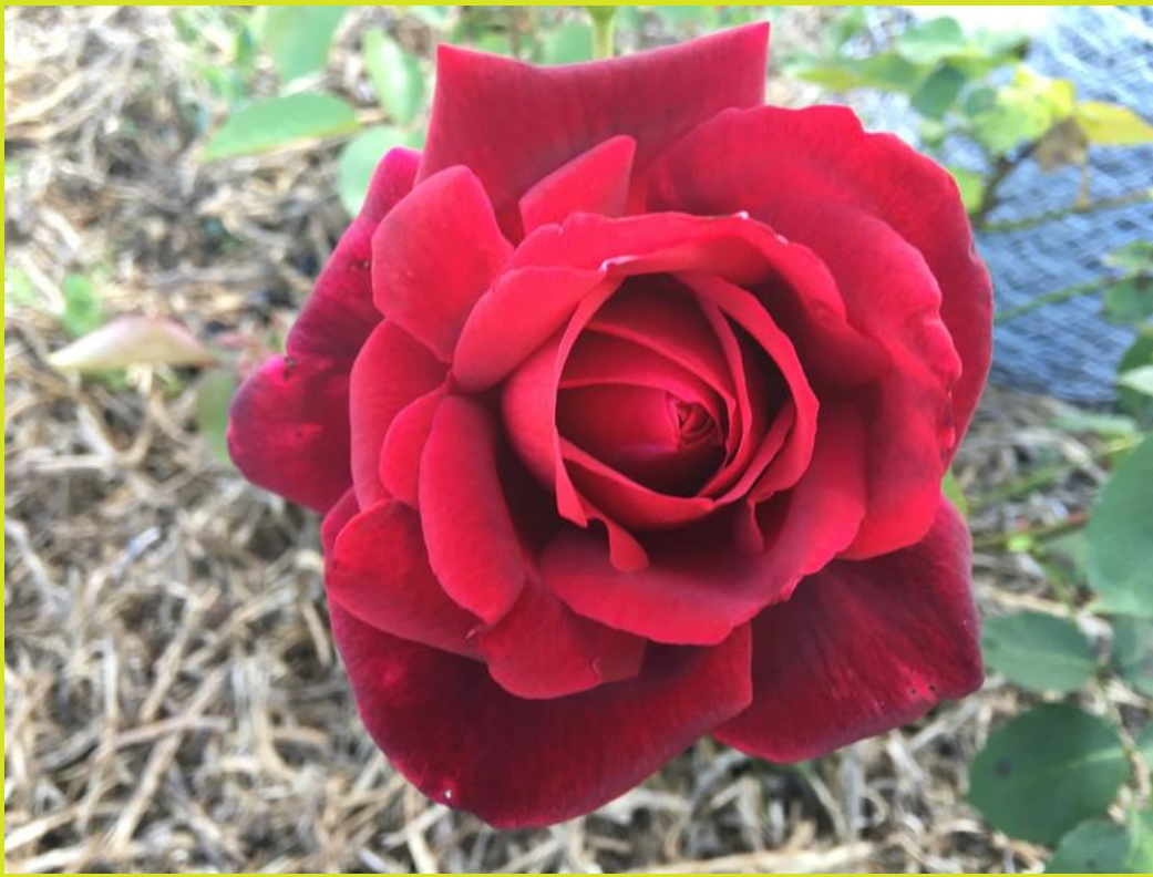
Rosa Papa Meiland https://www.treloarroses.com.au/Papa-Meiland-Rose