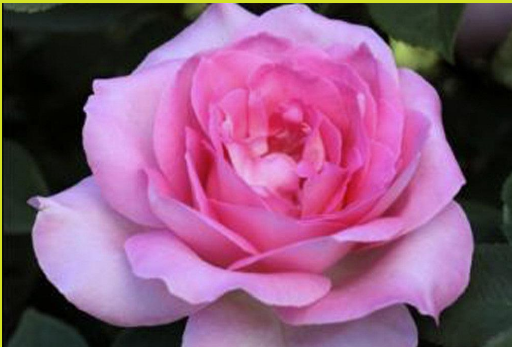
Rosa Perfume Passion https://www.wagnersrosenursery.com.au/