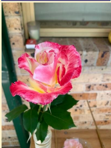
1 x Exhibition Rose Novice