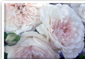
UNSH Signature Rose Sombreuil