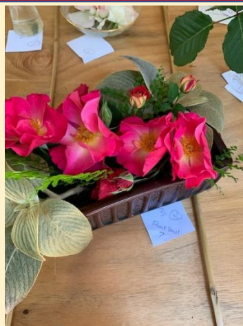
1 x Vase of a CUT rose (any rose) Novice