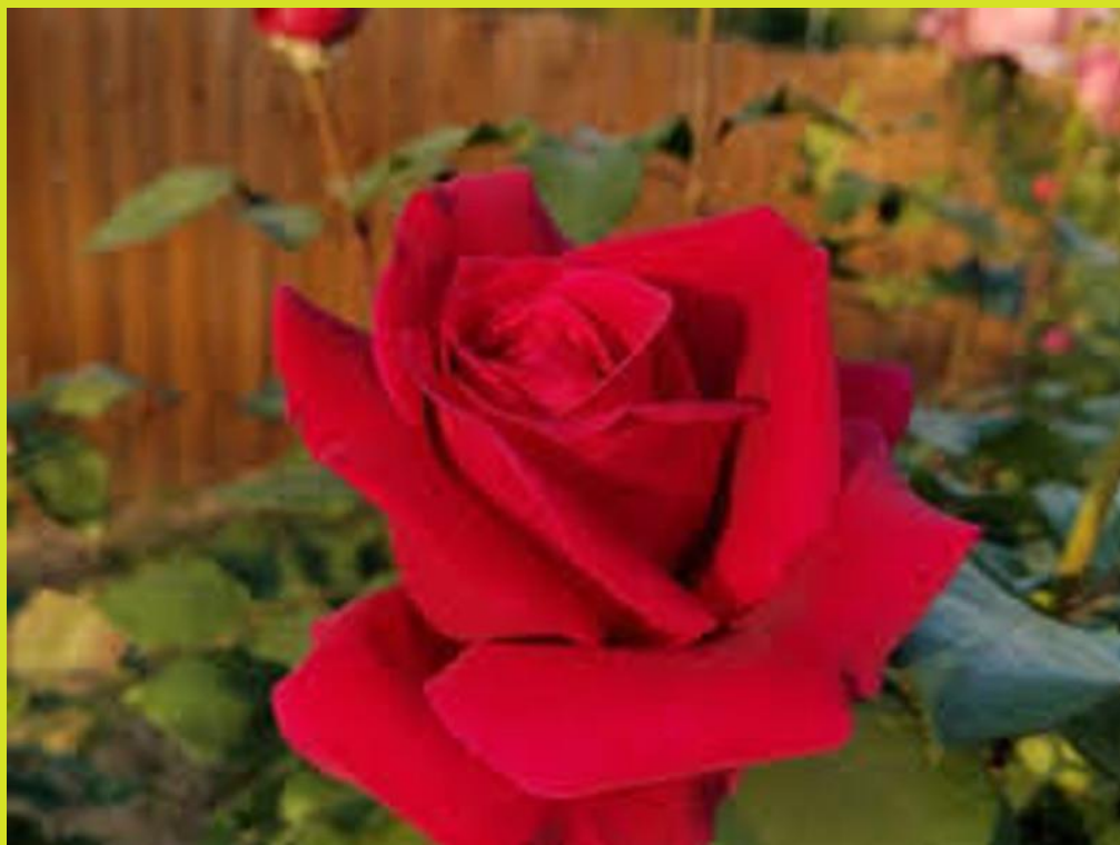
Rosa Firefighter https://rosesalesonline.com.au/