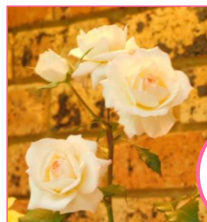
Exhibit: WALSH rose 'Blushing Barbara'