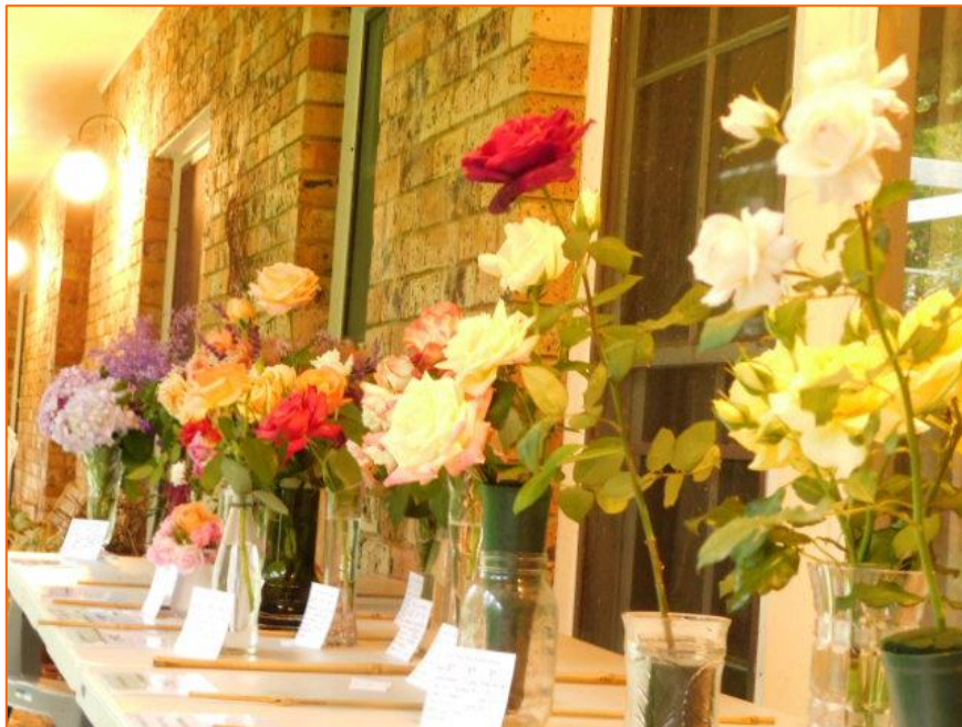
March Show Bench

Show Bench schedule will be sent out. Raffle and last meeting date to put in Neutrog order. Please place order in a named envelope.