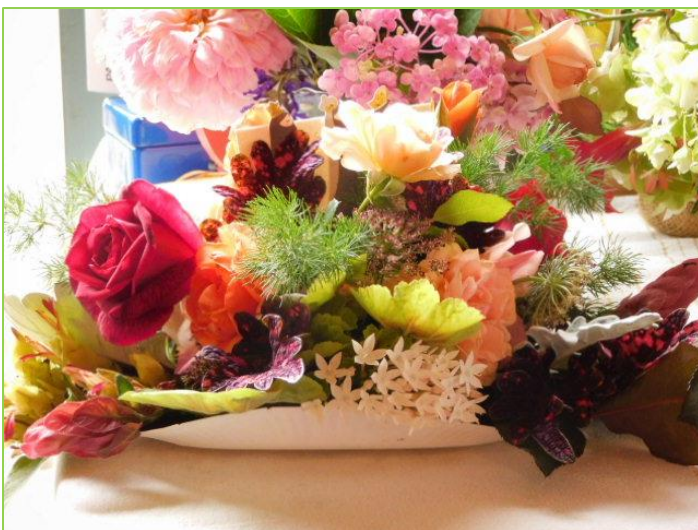
Left: Congratulations to the winner Jill Fraumeni

Not visible in the photograph were little nativity figurines amongst the foliage. Jill used beautiful floral form and colour to produce a dynamic effect.