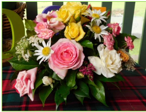
Left: 'Queen Elizabeth'