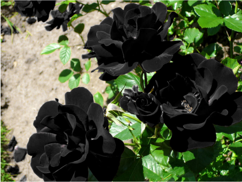
Halfeti's Black Rose

Fed by the waters of the Euphrates, black roses, an extremely rare flower grown in the village of Halfeti near the historical Urfa province, presents a unique natural beauty. The flower growing in that region requires a certain pH level, and even though it blooms red, it turns to black as the summer season progresses.