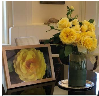
'Lady of Australia'