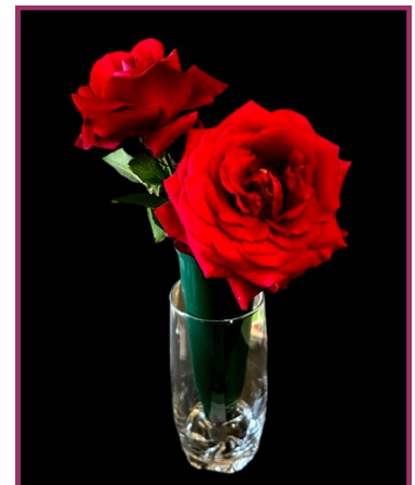
As Good As It Gets