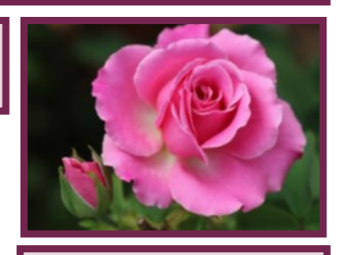
Signature Rose Best Friend