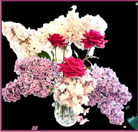
Miniature Rose with Lilac