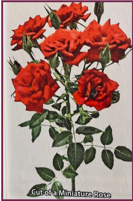
Cut of a Miniature Rose