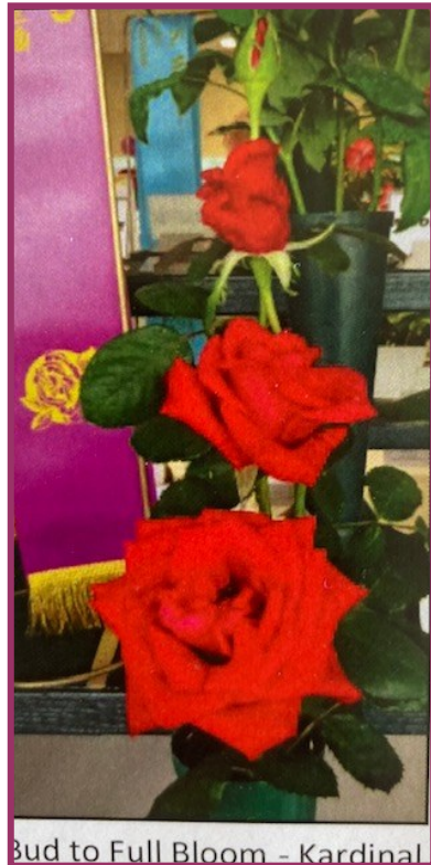
Bud to Full Bloom - Kardinal