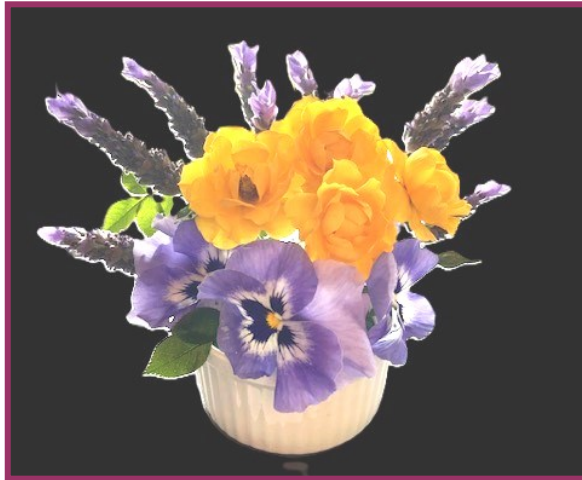
Luciola with Lavender & Pansies