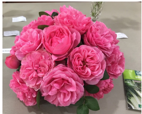
Nepean Blue Mountains Hawkesbury Prickles