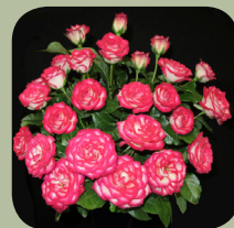
'Imp' Foundation Rose of the Regional