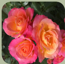
'Joyce Abounding' Signature Rose of the Regional