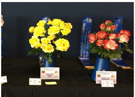
Champion Floribunda - Gold Bunny, Champion Grandiflora - Fire & Ice