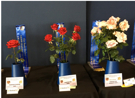
Champion Rose - Kardinal, Champion Bunch - Kardinal, Champion Decorative - Frantic