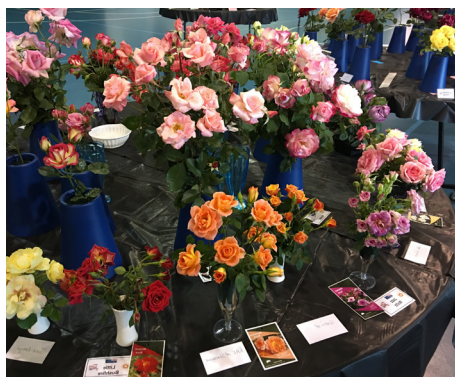
Some of the beautiful Australian Bred Rose exhibition blooms