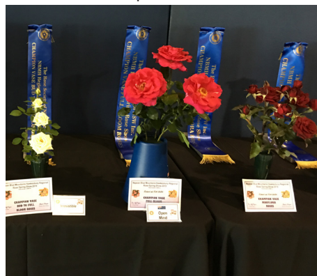
Champion BTFB - Irresistible, Champion Full Bloom - Open Mind, Champion Miniflora - Sebastian