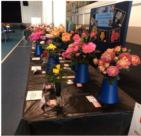
The Australian Bred Rose Championship exhibits