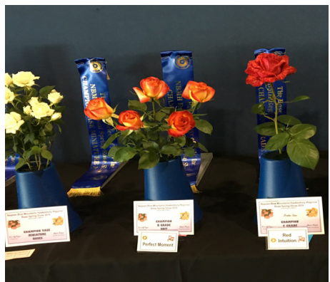
Champion Miniature - Baby Jack, Champion B Grade - Perfect Moment, Champion C Grade - Intuition

Nepean Blue Mountains Hawkesbury Prickles