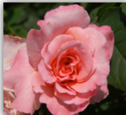
Fukuyama Rose bred by Kasuzo Tagashira

'Flowers are beautiful, but more beautiful are the hearts of the people raising them'.