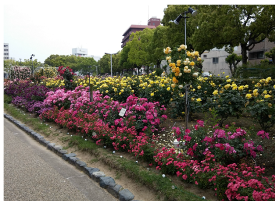
Fukuyama Rose Park Garden