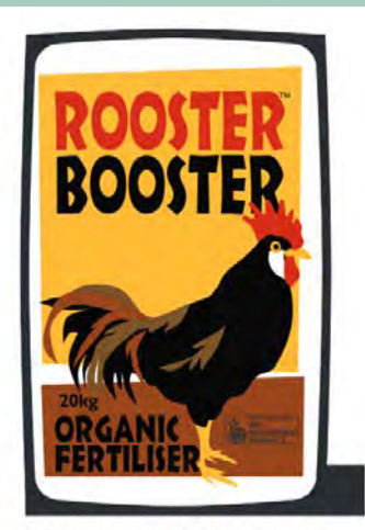
PELLETISED, COMPOSTED CHICKEN MANURE