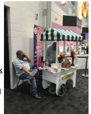
NSW Rose Society stall at the 2021 Easter Show

On April 17 the only Miniature and Miniflora Rose Show in Australia is being held at Mittagong RSL in Mittagong. Other than the Sydney Royal, this is the first 'live' rose show that has been held in NSW since the COVID 19 lock downs. This show is well worth visiting to learn more about miniature and miniflora roses and to see some excellent examples. I encourage you all to attend.