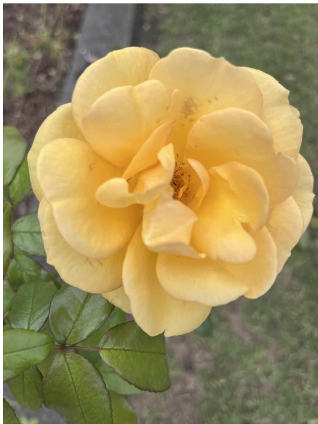
PHOTO- Golden Beauty full bloom, taken by Colin Hollis at Peace Park in April 2025