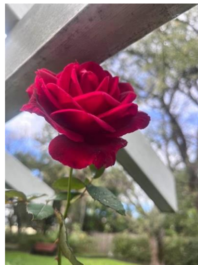
1. Golden Beauty 2. Firefighter 3 Gallipoli Rose