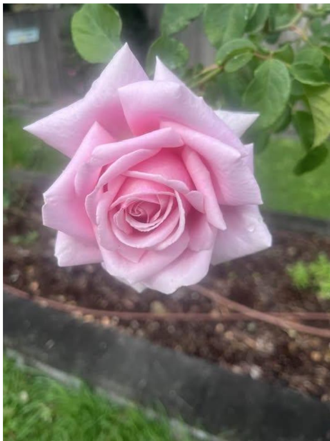
PHOTO- The Children's Rose, at Peace Park in May 2025