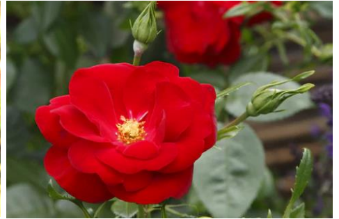
Cayenne -both Wagner’s & Treloar’s