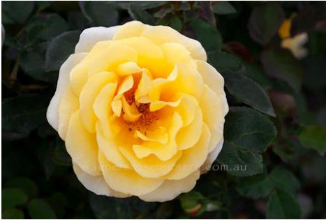
Lady of Australia – Wagner’s