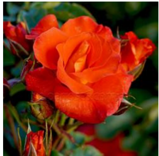
Afrikaans – Treloar Roses