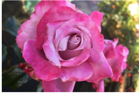
Spirit of Community-Wagner’s