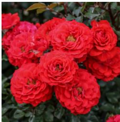
Dwarf Fairy – Treloar Roses