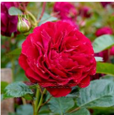
Bordeaux – Treloar Roses