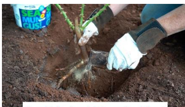
Step Eight: Apply Mycorrhizal Fungi Sprinkle Mycorrhizal Fungi on the roots while holding the rose over the hole.