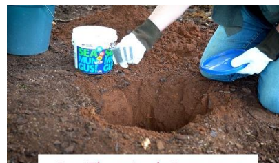
Step Three: Apply Seamungus

Add some soil into the bottom of the hole, covering the Seamungus, creating a mound.