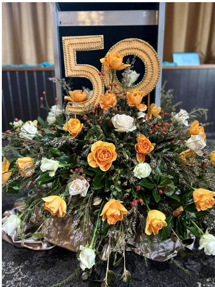
ILLAWARRA REGIONAL ROSE SOCIETY IS 50 YEARS OLD THIS YEAR: LET'S CELEBRATE 1974-2024