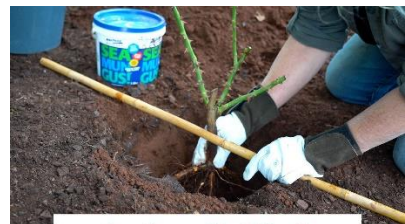
Step Seven: Check Depth

Position the base of the rose on top of the mound with the roots spread around and down.