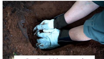
Step Four: Make a mound

Add some soil into the bottom of the hole, covering the Seamungus, creating a mound.