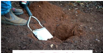
Step Two: Dig a hole Dig a hole that is approx. 30cm wide and deep. Loosen the soil in the bottom of the hole.