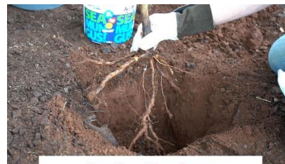
Step Five: Trim Roots

Sprinkle Seamungus into the bottom of the hole.