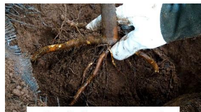
Step Six: Position on mound

If necessary, trim thick roots. Leave fine hair roots. Not all roses will need trimming or have fine hair roots.