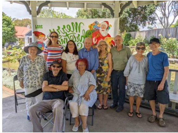
Jill with Bill's poster