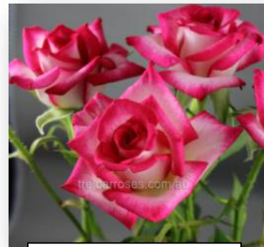
Magic Show - Miniature Rose