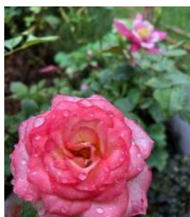
"Blushing Barbara" Rose