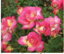
Signature Rose "Tablia"