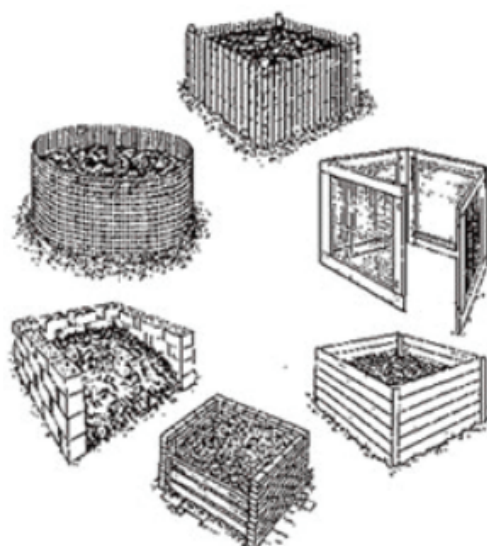
Contained compost pile options.

The best way to ensure that a compost system does not become smelly or swarming with gnats is to make sure that aerobic bacteria can thrive with adequate air circulation and a hospitable temperature range.