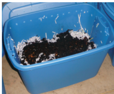
Uncovered worm bin tubs with holes.