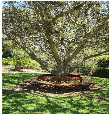
Garden Excursion April 18 th 2026