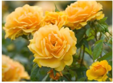
Photo: Picture of “ Golden Beauty Rose ” – is a prolific bloomer and a Gold Medal winner both internationally and at the National Rose Trial Awards. It also received People’s choice award in 2018. The glowing amber, high centered blooms are produced in large clusters on a very healthy compact bush of dark green leaves. A great performer in hot dry climates with fragrant blooms that don’t fade. From the classic to the romantic this rose is a great addition to any garden.