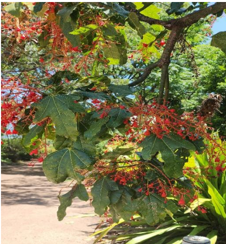
Shoalhaven Heads Native Botanic